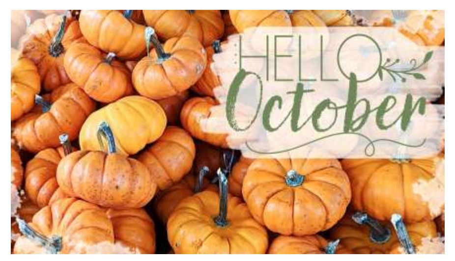
Message from the Pastor

THE OFFICIAL NEWSLETTER OF BETHEL UNITED METHODIST CHURCH Living our faith, sharing God's love.